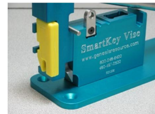
Presses u-ring fragment into SmartKey chamber!