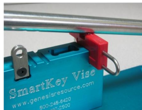
Secures SmartKey in vise-like grip!