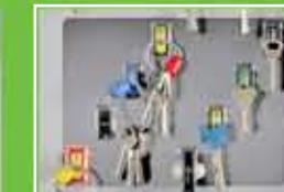
8 Key Module